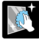
POLISHABLE BY HAND