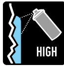
HIGH FILLIG POWER