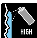
HIGH FILLING POWER