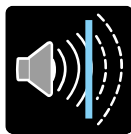
SOUND ABSORB- ING

Maston Underbody coating is a quick-drying bitumen-based protector for your car's chassis. It is flexible, hard-wearing, and provides excellent protection against rust. Instructions: Clean the surface carefully. Cover all surfaces that do not require treatment. Shake the container for approx. 3 minutes before use. Spray from a distance of approx. 30 cm. Spray several thin layers, letting the paste dry in between sprayings. This will give an even and protective result. Shake the container during the process to keep the paste liquid and spreadable. Clean nozzle after use: turn container upside down and press the nozzle until only propellant comes out. Drying time Approx 2 h at +20 °C. For stain removal we recommend Maston Thinner.