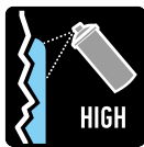
HIGH FILLIG POWER