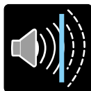
SOUND ABSORB- ING