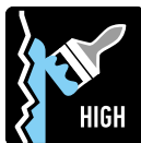
HIGH FILLIG POWER